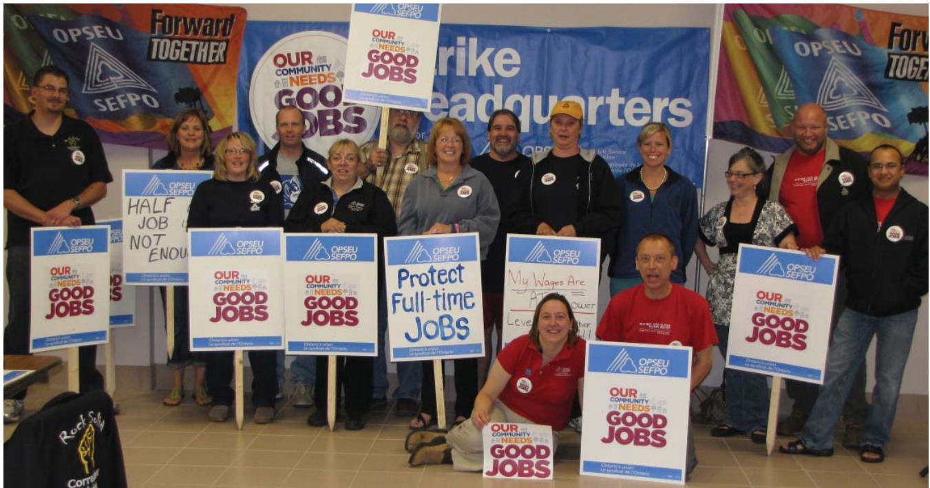
Members at the Grand Opening of the Strike Headquarters in Guelph June 18. Strike trailers and offices opened across Ontario this week.

Information for OPSEU members in the Liquor Board Employees Division • Issue #13 • June 19, 2009