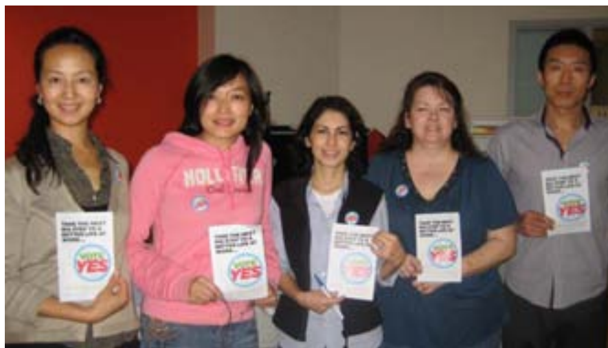
Support staff at the International Services Centre on the Newnham Campus of Seneca College in Toronto.

The Oct. 5 - 27 representation vote is a vote of part-time college support staff. Under the Colleges Collective Bargaining Act , this means every support staff worker who works at a college for 24 hours or less per week. It does not include any faculty (professors, instructors, counsellors or librarians).