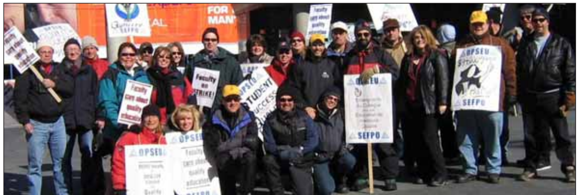
Our gang in Toronto.

"In this strike, the fact that management continues to target workload has made it impossible for there not to be a strike. For 20 years, management has been trying to roll back the workload articles, and as long as workload is on the table, faculty has to fight for it."