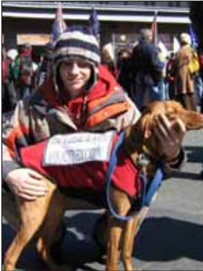
Getting out the message.