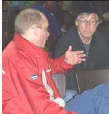
Members talk things over while waiting for the next speaker.

Sometimes you just never know what you're going to see at one of our meetings.