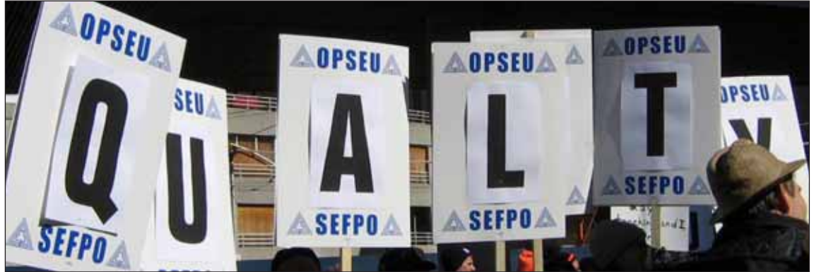
A sign for the times.