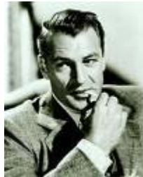
Gary Cooper, movie star.