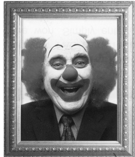
New Casino Niagara Security with a Good contract