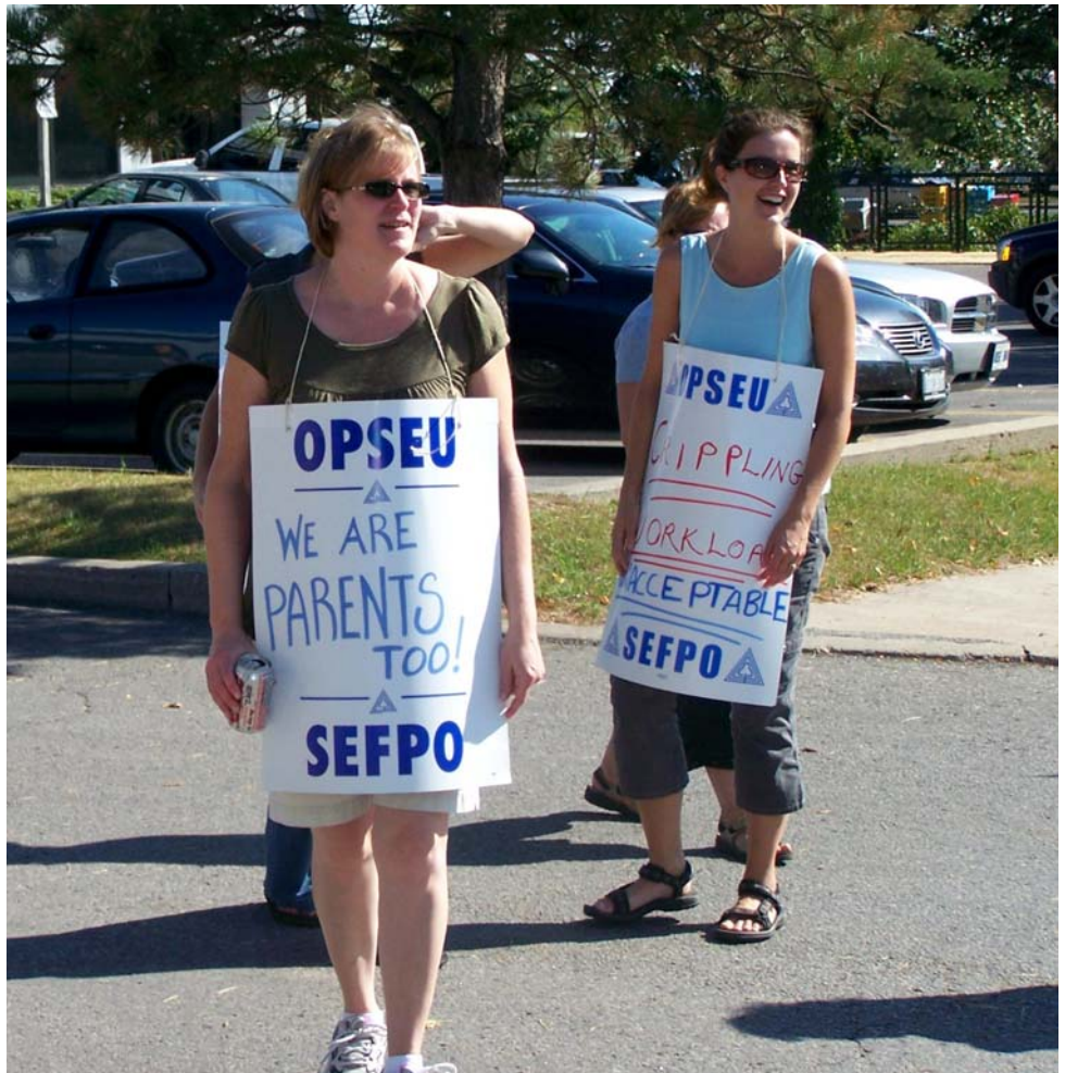
CAS workers were on the line for 17 days last year in York Region. Over the two-year agreement the wage increase will be almost 8 per cent per year. The focus on bargaining better contracts for CAS workers continues in 2008.